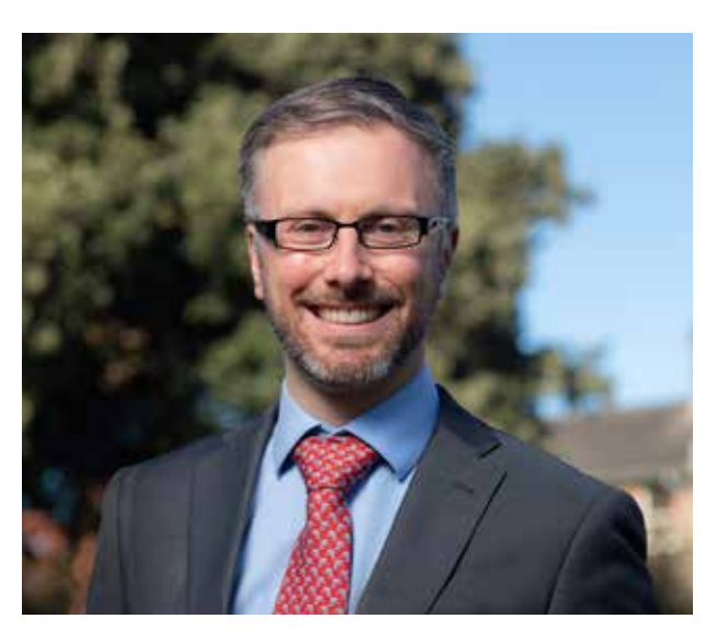
Minister Roderic O'Gorman, Minister for Children, Equality, Disability, Integration and Youth.